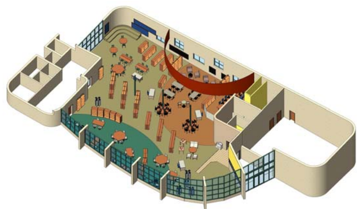
Phillis Wheatley Community Library Floor Plan

The objective for both facilities was to create areas within the existing libraries specifically for teens. Bold color, space defining ceilings, new lighting and furniture complete the teens' zone. The shelving has been reoriented and reconfigured to provide better line of sight and definition between the adults, teens, and children areas throughout the libraries.