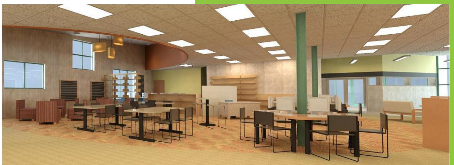
Phillis Wheatley Community Library Rendering