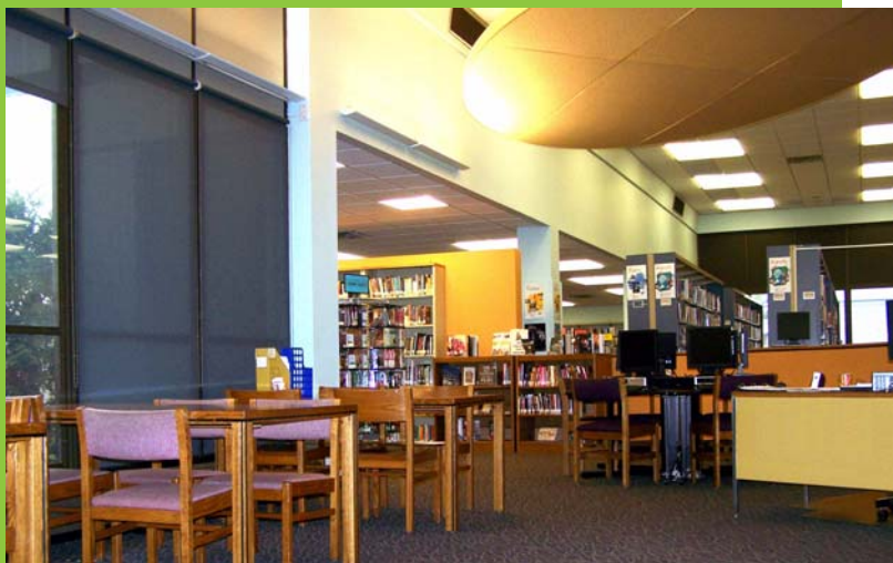
Arnett Branch Library