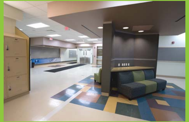
RIT-College of Imaging Arts & Sciences Rochester NY

This interior renovation of 54,000 square feet brought the Gannett Building from film photography to digital technology. New spaces included large tiered computer labs, editing stations and printing facilities. Interiors for these spaces are "color neutral" for optimum productivity. The Film Study and Animation School has state of the art theaters and acoustically controlled recording rooms. Social spaces and corridors encourage student community with its energetic colors and forms.