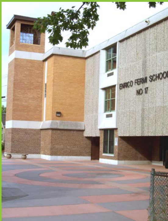
Enrico Fermi School No.17 Rochester City School District Rochester NY

This interior renovation of 54,000 square feet brought the Gannett Building from film photography to digital technology. New spaces included large tiered computer labs, editing stations and printing facilities. Interiors for these spaces are "color neutral" for optimum productivity. The Film Study and Animation School has state of the art theaters and acoustically controlled recording rooms. Social spaces and corridors encourage student community with its energetic colors and forms.